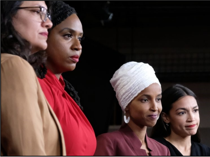
Congressional Representatives (L-R) Rashida Tlaib-Palestinian American/Michigan; Ayanna Pressley-African American/Massachusetts; Ilhan Omar-Somali American/Minnesota; Alexandria Ocasio-Cortez-Latina American (Puerto Rico)/New York

The Sexual Predator on Pennsylvania Avenue in his recent vicious attacks on “The Squad”: Ilhan Omar, Ayana Pressley, Alexandria Ocasio-Cortez, and Rashida Tlaib, told these women of color to “go back to their crime-infested” countries. All of these women are American citizens. All of these women are proud of their heritage and work for their respective communities. All of these women are being attacked because they fight for the working class, challenge white supremacy, and patriarchy and because they are women. They dare to be women who have political conviction around their support of Palestine, their support of Venezuela, and their denunciation of Trump’s border camps.